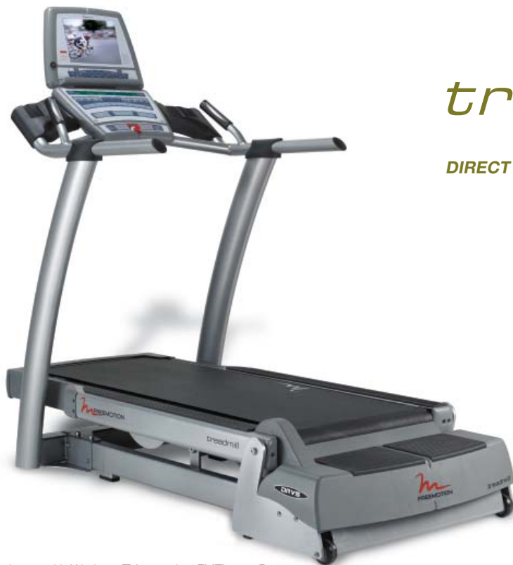
Treadmill shown with Workout TV console - FMTL8505P